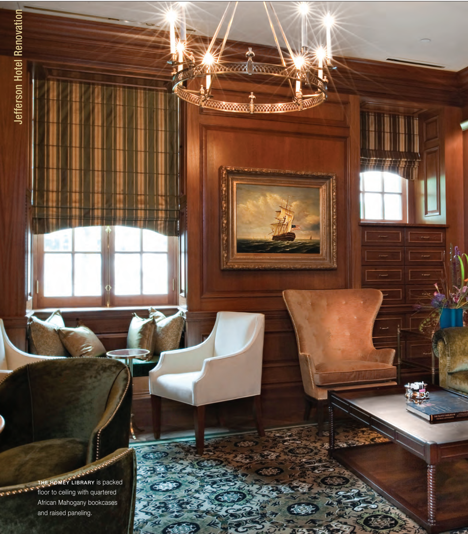
THE HOMEY LIBRARY is packed floor to ceiling with quartered African Mahogany bookcases and raised paneling.