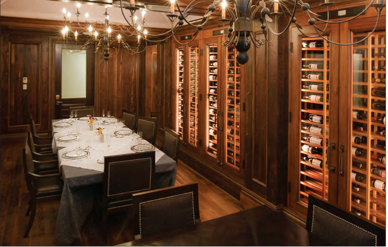
▲ THE PRIVATE DINING ROOM, which holds a vast wine collection, is warmly clad in distressed heart Pine.