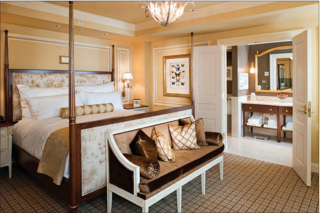
▲ UNDERSTATED ELEGANCE AND COMFORT are a hallmark of the guest rooms.